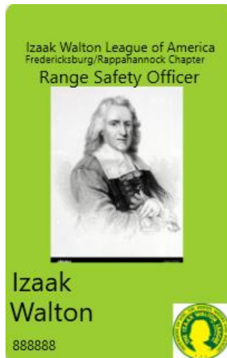
Range Safety Officer